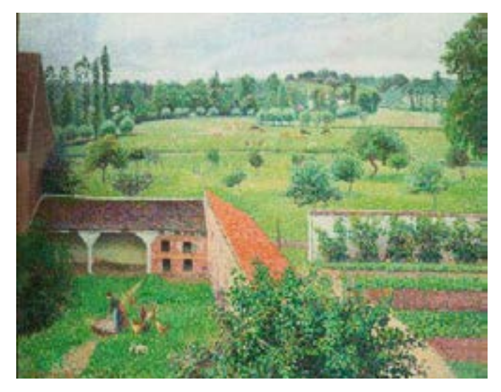
Vue de ma Fenetre, Eragny Camille Pissarro, 1888, France WA1959.185