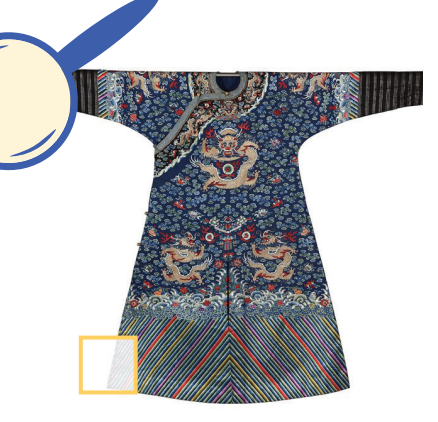
Chinese Dragon Robe

Chinese stories are full of dragons, and the dragon in the centre of the coat is chasing the Pearl of Wisdom. Look carefully – how many other dragons can you find?