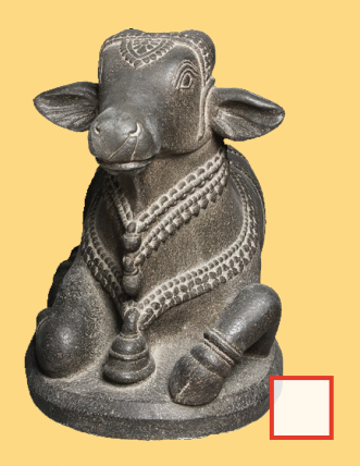
Nandi the Bull