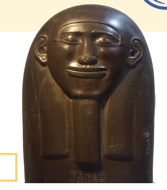
Sarcophagus of Ptahhotep

Ptahhotep looks like he's smiling. What do you think he is thinking about?