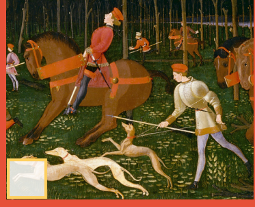
Hunt in the Forest

Go downstairs into gallery 32, Level 1 →