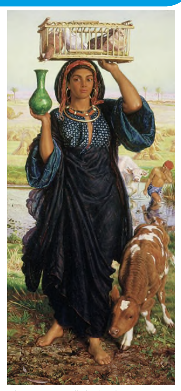
This painting is called 'Afterglow in Egypt'. It was painted by William Holman Hunt in 1861.

? What did you like best on your visit today and why?