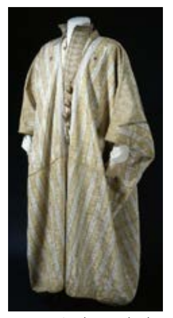
Lawrence's robes on display in Gallery 6, Textiles. Lent by All Souls College, University of Oxford.

The challenge is for teachers to use objects to develop culturally enriching, relevant and practical learning opportunities across the curriculum.