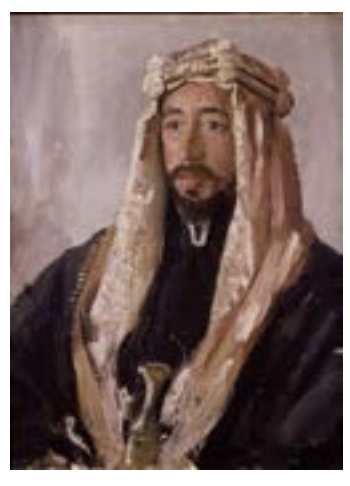
'The Emir Faisal' by Augustus John. Painted in April 1919. Not currently on display.