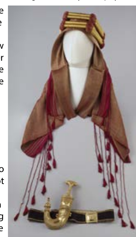
This headdress and dagger were a gift display in Gallery 5, Textiles. Lent from All Souls College, University of Oxford.