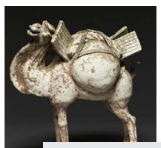
Camel, China 800s AD Gallery 28: Asian Crossroads (EA1956.988)