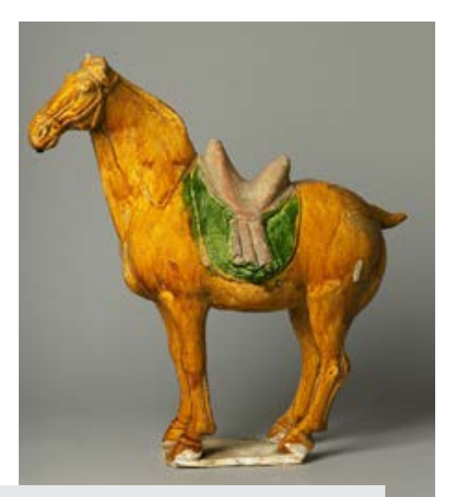
Earthenware horse, China 700s AD Gallery 10: China to AD 800 (EAX.3960)