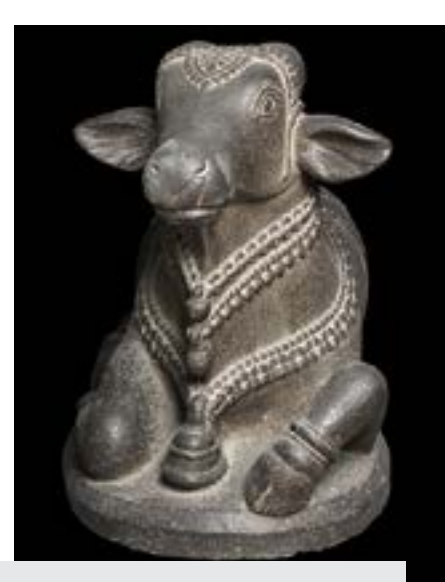
Nandi the bull, India 700s AD Gallery 32: India from AD 600 (EA05.77)